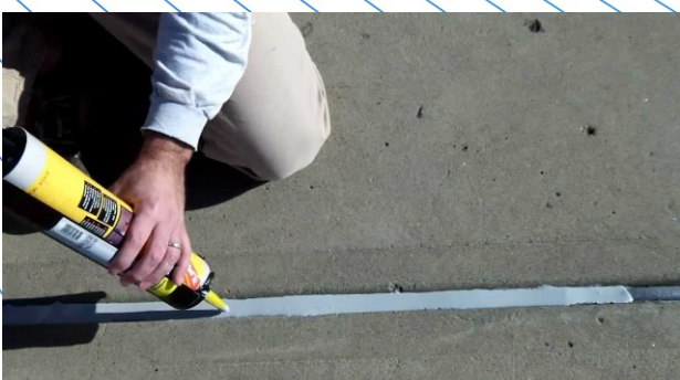
Expansion Joint Sealing