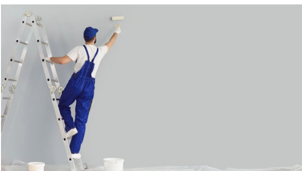
Interior & Exterior Painting