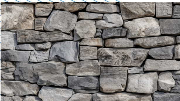
Stone and Wood Preservation