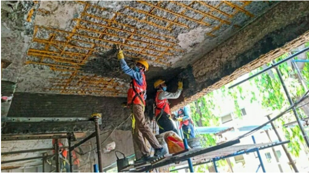
Structural Renovation & Restoration